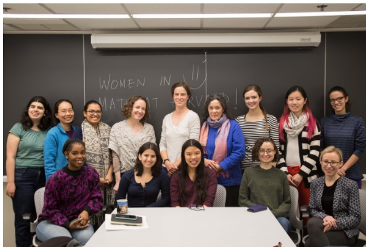
A Women in Math lunch with undergraduates, graduate students, post-docs and faculty. See “Activities” page for details.

Interested in graduate school? Please find advice and information in the pamphlet “Graduate Schools and Fellowships in Mathematics” at http://math.harvard.edu/pamphlets/gradsch.pdf .