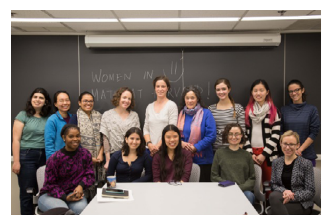
A Women in Math lunch with undergraduates, graduate students, post-docs and faculty. See "Activities" page for details.

The math department usually holds an info session on summer research in early December. More info here: <u>https://www.math.harvard.edu/</u> <u>undergraduate/undergraduate-research/</u>. Also, check with the Harvard Office of Career Services.