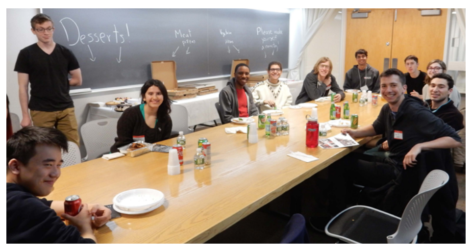
The department hosts a welcome lunch for new sophomore concentrators every year after they declare concentration. A few upper-year students and faculty are also invited, to share advice and answer questions.

Sessions happen every year, one in the early fall for fourth year students currently writing a thesis and one in the late spring for second or third year students who want to know more about writing a thesis). Answers to commonly asked questions can be found here: <u>https://www.math.harvard.edu/media/Honors-in-Mathematics-2025-2026.pdf</u>.