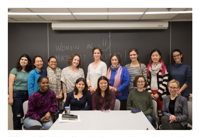
A Women in Math lunch with undergraduates, graduate students, post-docs and faculty. See "Activities" page for details.

The math department usually holds an info session on summer research in early December. More info here: <a href="https://www.math.harvard.edu/undergraduate/undergraduate-research/">https://www.math.harvard.edu/undergraduate/undergraduate-research/</a>. Also, check with the Harvard Office of Career Services.